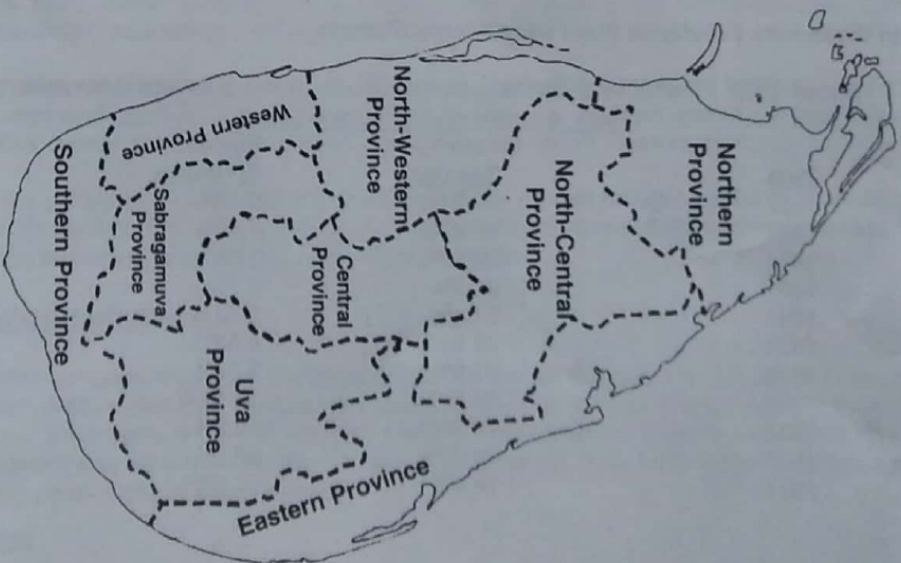
Nine Provinces (1896)