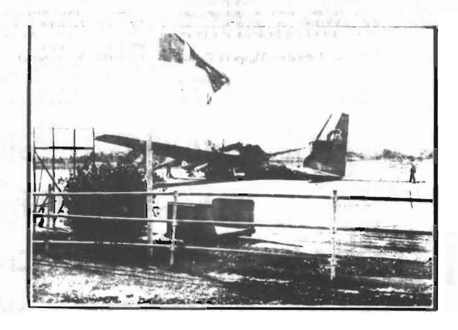
The News Line Monday July 16 1979