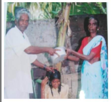
Mother, father and daughter celebrating a family culture